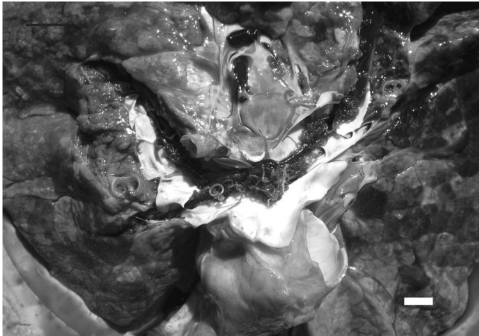
FIGURE 1. The dorsal surface of the lungs of a California sea lion infected with Otostrongylus circumlitus . Note the numerous nematodes in the lumen of the pulmonary artery. Bar = 2.0 cm.

malin, routinely processed for paraffin embedding, sectioned at 5 \mu\text{m} , and stained with hematoxylin and eosin (Luna, 1968). Histologic findings in the lungs included severe suppurative and necrotizing arteritis with vascular thrombosis, interstitial pneumonia, and large areas of pulmonary