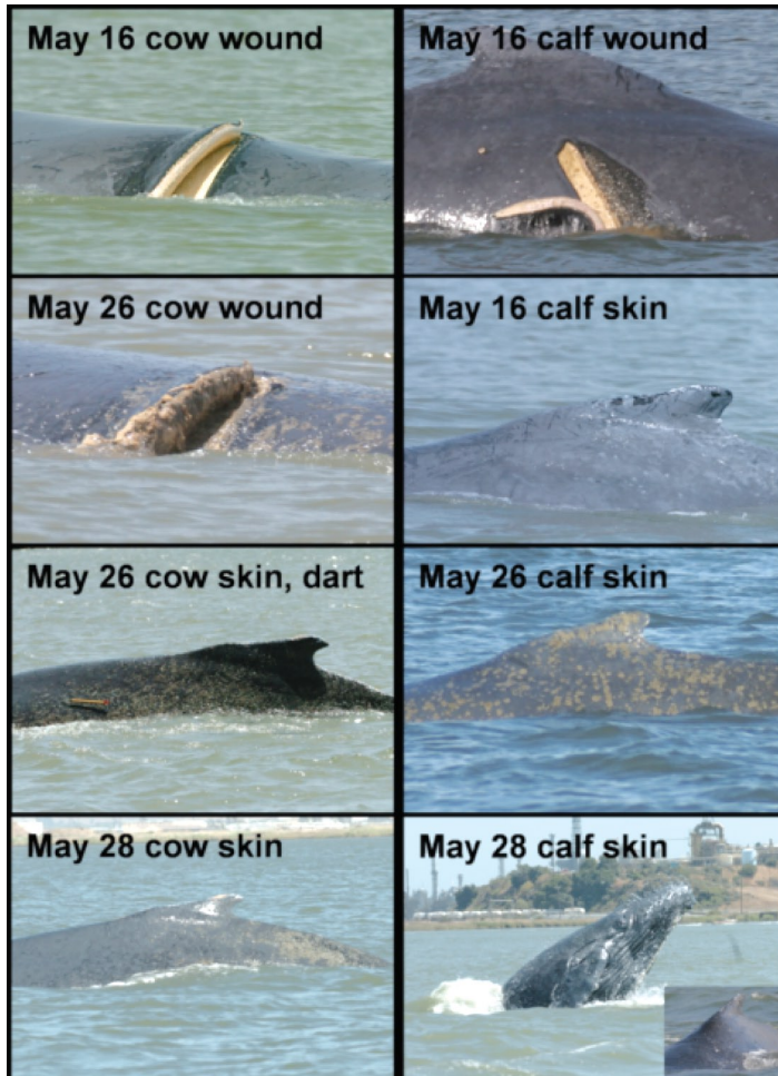
Figure 2. Changes in skin and wound conditions in the mother and calf humpback whale over 16 d

proximity to the whales at source levels exceeding 180 dB re: 1 \mu Pa. After the use of a fire hose on 25 May, the whales turned 90° towards the bank of the river, and then turned back north at 100 m from the fireboat. This intervention was repeated three times, and the same response was observed.