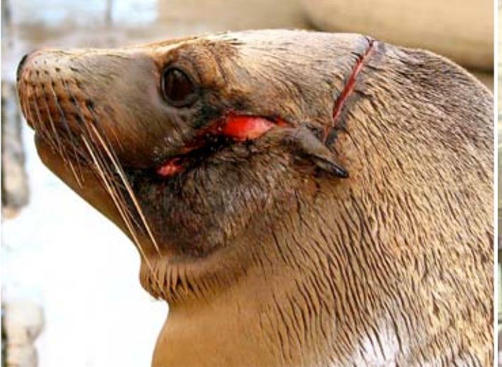
The key to understanding marine mammal health