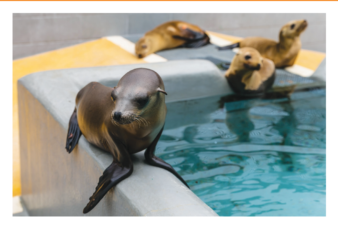
Rescued over 320 sea lion adults and pups over the span of just two months, treating them for starvation and domoic acid toxicosis due to changing ocean conditions.

Performed the first CT scan, with partners like NOAA, on a wild Hawaiian monk seal known as RH38. The CT scan allowed experts to resolve her complex diagnosis and begin a treatment regimen that led to a successful release back into the wild.