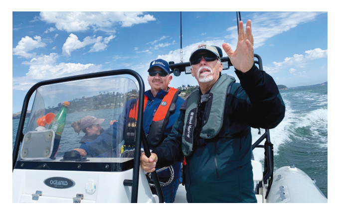
Added a Cetacean Field Research program , a group of top researchers who focus on extending protections for whales, dolphins and porpoises to address negative human interactions, like ship strikes, through scientific field research and our community science portal, where citizens submitted 34 reports of cetacean sightings.

Contributed 19 scientific research papers to peer-reviewed journals and conducted 80 ongoing research projects in which we partnered with scientists around the world on collaborative research that utilizes samples or data collected by the Center.