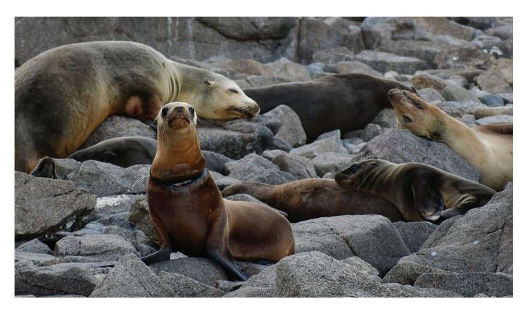
Disentangled and released 15 wild California sea lions while collecting health data with partner researchers on San Miguel Island in Channel Islands National Park. Satellite telemetry tags we attached to the sea lions will help us better understand how to prevent entanglements in the first place.

that researchers estimated had less than one percent chance of survival without help. After nearly a year rehabilitating at Ke Kai Ola, our hospital on the Big Island that's dedicated to conserving this endangered species, these four seals were successfully returned to the wild.