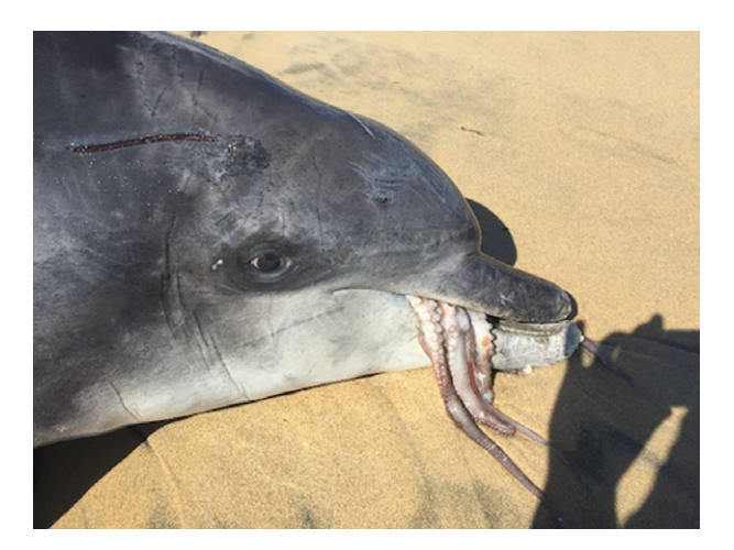
Figure 1. Adult male Tursiops aduncus ("Gilligan") as found on the beach.

An adult male Indo-Pacific bottlenose dolphin ( Tursiops aduncus ) was found dead at Stratham Beach, Western Australia (33°21'7"S, 115°34'30"E) on 30 August 2015; octopus arms were protruding from its mouth (Fig. 1). Based upon comparison to the photo-identification catalog images, the dolphin was definitively identified as a known male named "Gilligan." It was first sighted as an adult in July 2007, and was therefore estimated to be in excess of 20 yr of age; it had been sighted 25 times since surveys began mid-2007 ( i.e. , 8 yr prior to death), and was documented to be in an alliance with two other adult male individuals. Interestingly, this case occurred on