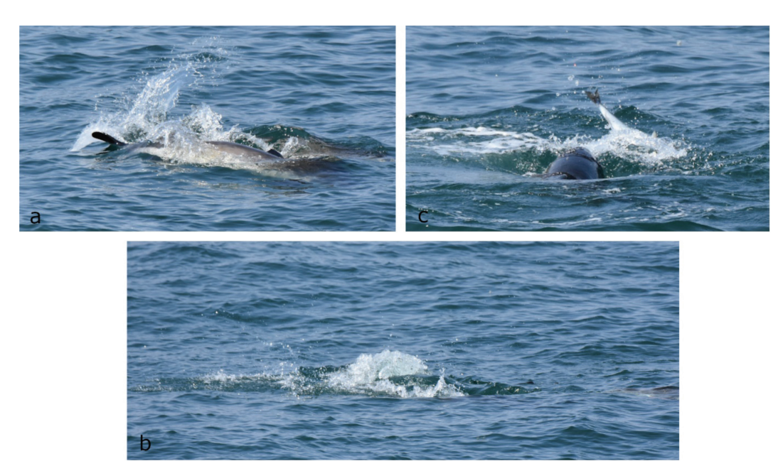
Figure 3a-c. Harbor porpoise capturing, carrying, and throwing a large fish (likely a salmonid) at the surface in Burrows Bay, Fidalgo Island, Washington, on 12 August 2017