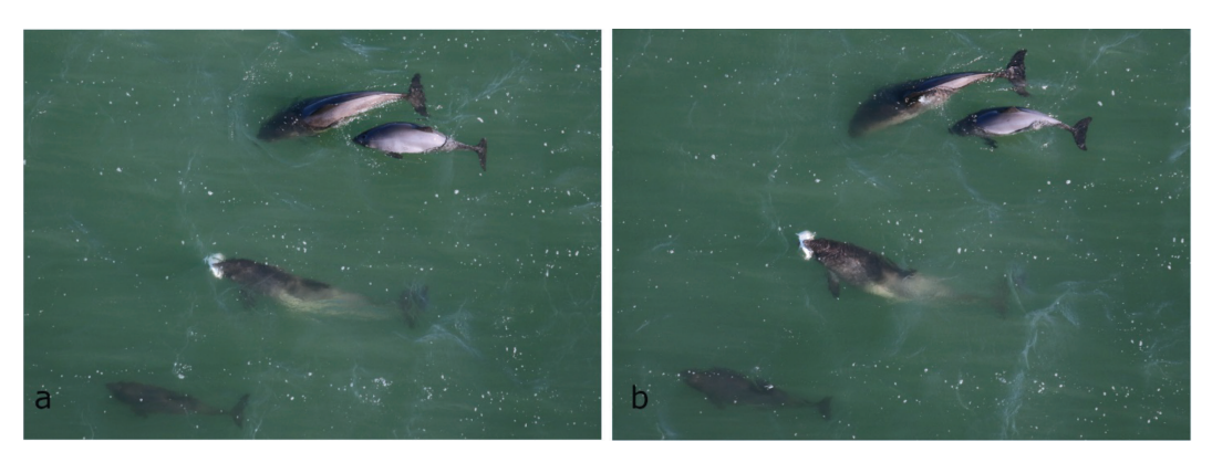
Figure 6a-b. Female harbor porpoise with calf carrying an American shad at the surface in San Francisco Bay, California, on 19 October 2016

Salmonid species are typically larger in length and mass than the majority of prey species known to be consumed by harbor porpoises. Average fork length (measured from the snout to the end of the middle caudal fin rays) of mature salmon for five species commonly found in the Salish Sea ranged from 53.8 to 80.0 cm, while wet mass ranged from 1,858 to 7,807 g (O'Neill et al., 2014). The Alaska Department of Fish and Game documents that pink salmon (the smallest salmon species in the Pacific found in North America) range from 45.7 to 63.5 cm and weigh 1,360 to 2,495 g. Additionally, American shad (which was introduced to the U.S. West Coast in the 19th century), like salmon species, are larger than the most common prey items consumed by harbor porpoises. The U.S. Fish and Wildlife Service describes American shad adult females as averaging 61.7 cm, adult males averaging 50 cm, and both weighing up to 5,500 g. Even if harbor porpoises consume juvenile/subadult individuals of either species, they would likely be, on average, larger than more common prey species such as Pacific hake (Merluccius productus), Pacific herring (Clupea pallasi), northern anchovy (Engraulis mordax), rockfish (Sebastes spp.), walleye pollock (Theragra chalcogramma), and various squid species (Jones,