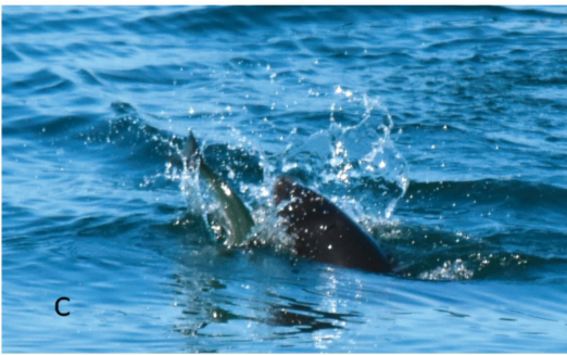
Figure 4a-c. Harbor porpoise capturing and carrying a large fish (likely a coho salmon) at the surface in Burrows Bay, Fidalgo Island, Washington, on 25 July 2019