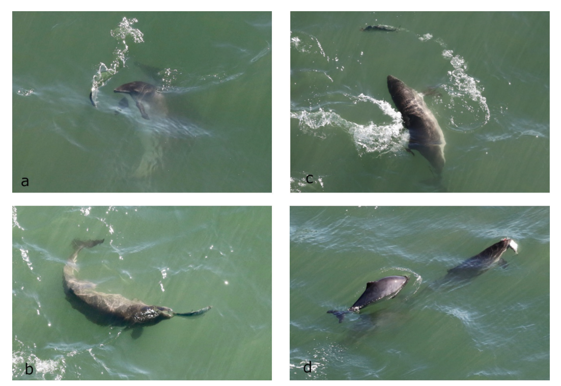
Figure 5a-d. Harbor porpoise capturing and carrying an American shad ( Alosa sapidissima ) at the surface in San Francisco Bay, California, on 17 November 2017

The sightings and photographs in San Francisco Bay were taken by W. Keener on 17 November 2017 (Figure 5) and by M. Webber on 19 October 2016 (Figure 6) from the Golden Gate Bridge. The 2017 photographs show a harbor porpoise capturing a large fish, identified as an American shad (Alosa sapidissima; J. Ervin, pers. comm., 13 July 2019). The chase and capture took approximately 30 s. The sequence of events here was very similar to that seen for the harbor porpoise pursuing the salmon in Burrows Bay. The porpoise is clearly accelerating after the fish, turning tightly at the surface as the chase continues (Figure 5). After the fish is caught, the porpoise surfaced multiple times (Figure 5; supplemental video; the supplemental video is available on the Aquatic Mammals website: https://www.aquaticmammals journal.org/index.php?option=com content &view=article&id=10&Itemid=147), carrying the fish cross-wise in its mouth as did the harbor porpoise carrying the salmon in Burrows Bay. Similar behavior by a harbor porpoise carrying a large American shad (J. Ervin, pers. comm., 13 July