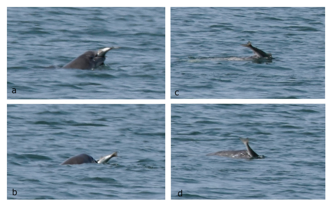
Figure 2a-d. Harbor porpoise ( Phocoena phocoena vomerina ) capturing and carrying a large fish (likely a salmonid) at the surface in Burrows Bay, Fidalgo Island, Washington, on 7 August 2017