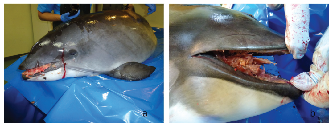
Figure 7a-b. Lactating female harbor porpoise with partially digested salmon (likely pink salmon) in throat. Female drowned in drift net of active salmon fishery in Cook Inlet, Alaska, on 8 August 2014. (Photographs by Marc Webber; MMSHRP Permit #932-1905/MA-009526 and Prescott Grant #NA12NMF4390162)

1981; Dorfman, 1990; Walker et al., 1998; Toperoff, 2002; Nichol et al., 2013; Oliaro, 2013). For example, four common prey species documented for harbor porpoises in the Salish Sea had fish lengths (estimated from body length-otolith length relationships) ranging from 7.8 to 36.4 cm, and mass ranging from 12.6 to 247.7 g (Nichol et al., 2013). However, prey length and mass may be underestimated when using otolith remains due to erosion, and the rate at which otoliths erode varies by prey species, so some species may be missed or underrepresented (Nichol et al., 2013). It is also worth noting that infrequently caught prey items may be missed completely by dietary analyses, particularly if part of the prey is not ingested. For example, if Smith & Gaskin's (1974) suggestion that harbor porpoises bite larger fish at the gills without consuming the head of the prey is correct, these types of captures would be missed in diet studies based on otolith remains. Two of the noted diet studies from California reduced this bias by utilizing other techniques that do not rely on visual and/or microscopic description-stable isotope ratios (Toperoff, 2002) and PCR-based molecular techniques (Oliaro, 2013).